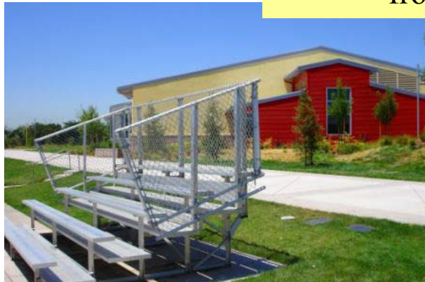
Vegetated Bio-swale run-off from walkways