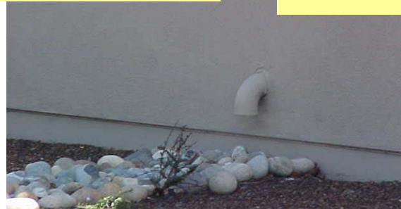
Downspouts connecting to Rocky Swales

Constructed C3 and HMP Projects in San Jose