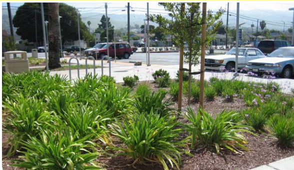
Vegetated Bio-Swale front of building