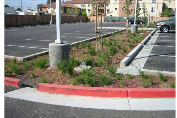
Vegetated Bio-Swale w/curb cuts