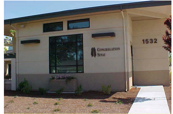
Landscaping Strips to Treat Roof Runoff