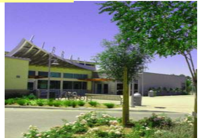
Parking Lot vegetated Bio-swale.