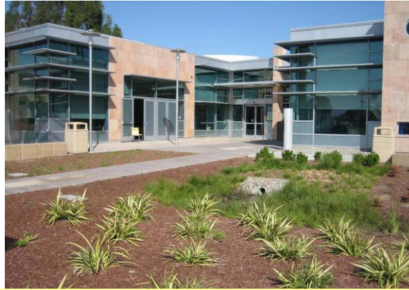
Retention Pond: outlet from Roof