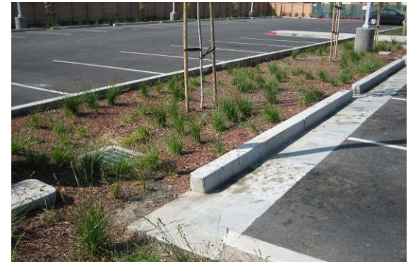
Parking Lot curb cuts detail at vegetated Bio-Swale

Constructed C3 and HMP Projects in San Jose