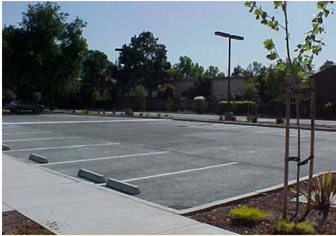
Pervious Concrete Parking Lot