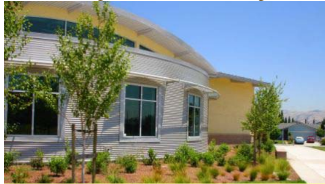
Vegetated Bio-swale-run-off from walkways