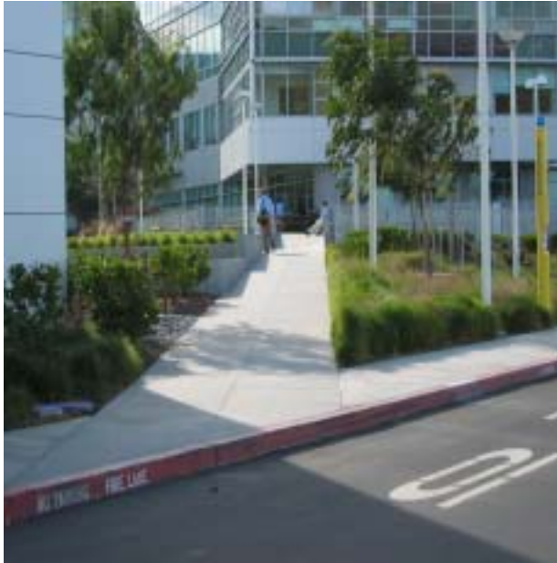
This walkway slopes toward landscaped vegetation; with multi-story buildings in background.