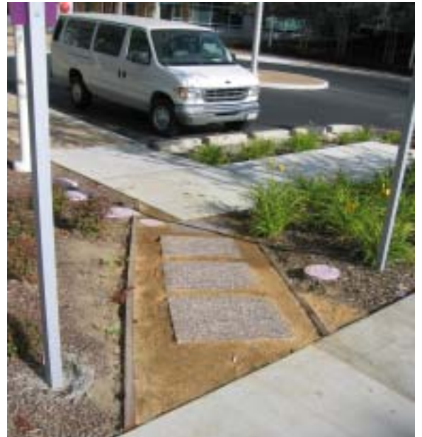
Pervious walkways used between concrete sidewalks.