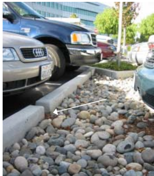
Parking lot runoff drains through curb cuts and then filters through the rocky swale. Trees provide visual amenities as well as reduce the volume and velocity of runoff.