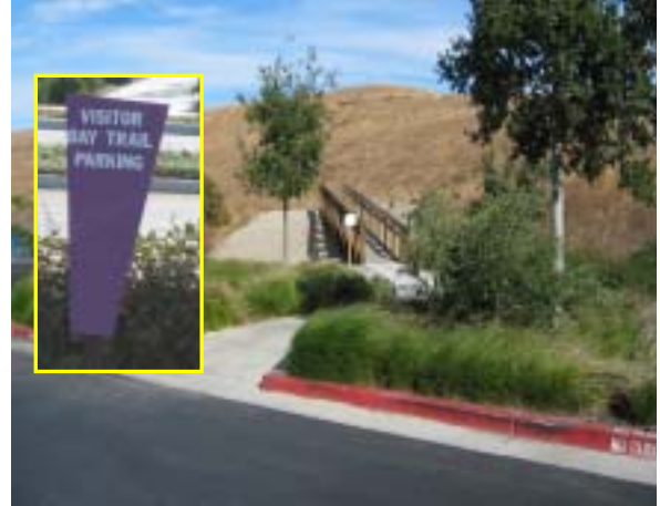
On-site parking is provided for visitors to the Bay Trail (located behind the Yahoo! Campus).