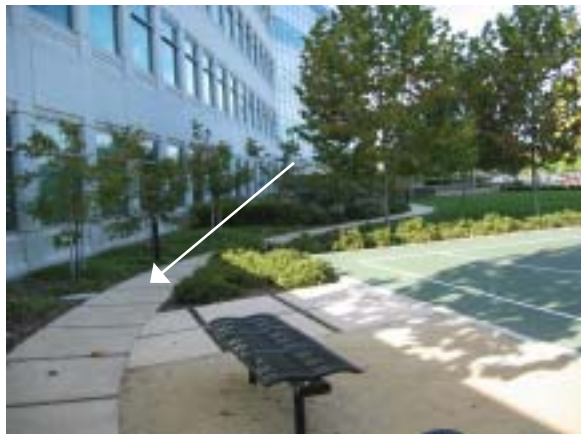
This pathway made of pervious pavers allows infiltration through the sand filled crevices. Also, these benches are provided on pervious surfaces.