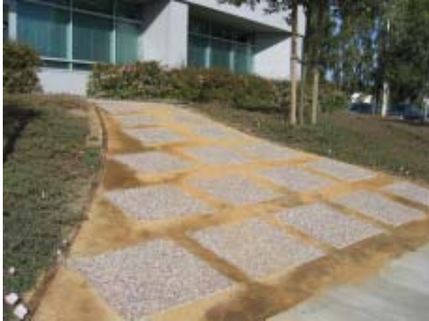
Pervious walkways used to minimize impervious surfaces.