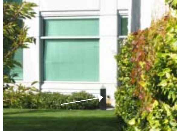
Runoff from rooftop drains into landscaping reducing the directly-connected impervious area (DCIA).